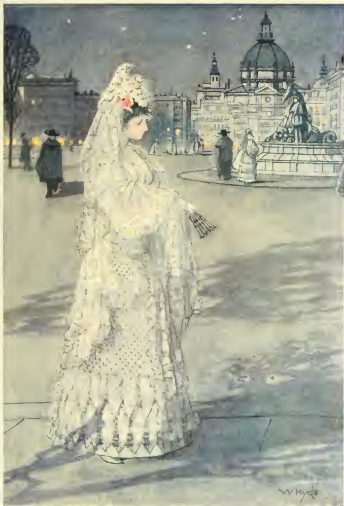
MADRID BY NIGHT.